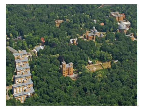
Potsdam, Telegrafenberg (19<sup>th</sup> century)